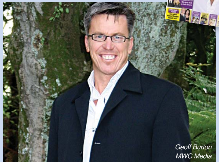
Geoff Burton MWC Media

"We went ahead with this and even though time was tight MWC came through with an excellent promotion. They sold us on the name 'Blue September' and then worked very hard to make the whole promotion successful."